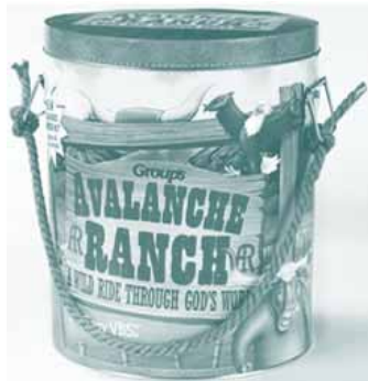
"Avalanche Ranch" July 8 th - 13 th , 2007

VBS is just around the corner and the theme this year is western. Last year's evening program went very well. I would like to change it just a bit this year. I would like to start on Sunday evening, and go through Thursday with the program on Friday. On Sunday I would like to kick-off the night with a dinner. Nothing fancy, just hot dogs and chips and such. I would love your feedback on this.